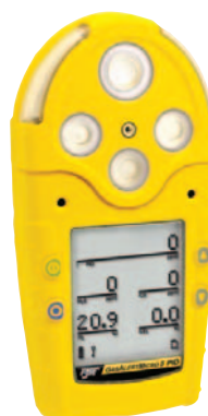
GasAlertMicro 5 PID Diffusion version with datalogging