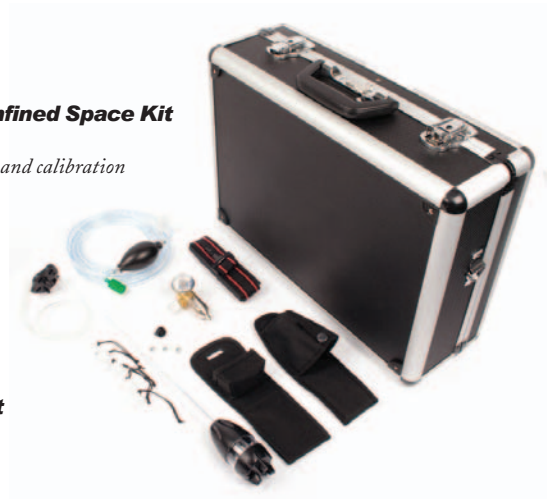
Deluxe Confined Space Kit M5-CK-DL Order detector and calibration gas separately