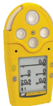
GasAlertMicro 5 Diffusion version with datalogging