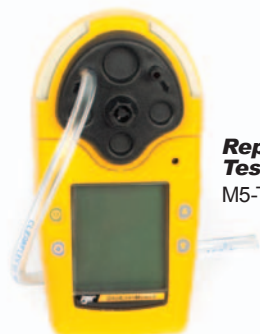
Replacement Test Cap and Hose M5-TC-1

* Change order number suffix "-N" to: "-E" for European versions, "-U" for United Kingdom versions, "-A" for Australian versions.