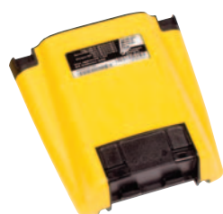
Alkaline Battery Pack M5-BAT0501/M5-BAT0501B M5-BAT0502/M5-BAT0502B

*Battery packs should be used with the new versions GasAlertMicro 5 Series gas detectors that have red circuit boards. See the Sensor Accessories, Spares and Replacements section for order information on batteries for the old version GasAlertMicro 5 Series gas detectors (green circuit boards).