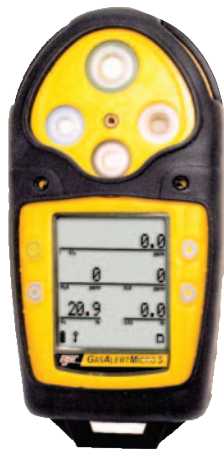
Concussion-Proof Boot GA-BM5-1 For GasAlertMicro 5 Series diffusion units