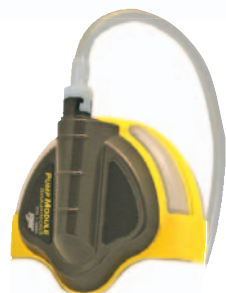
M5 Pump M5-PUMP