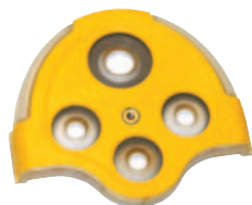
Replacement Diffusion Cover M5-DC-1