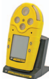
Cradle Charger Kit with Battery M5-C01-BAT08 / M5-C01-BAT08B Complete with charger and rechargeable battery pack