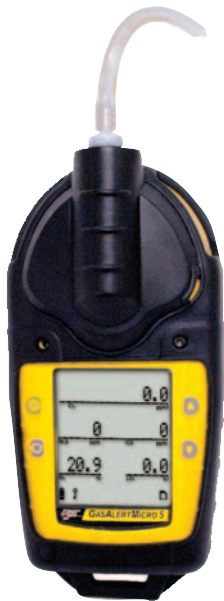
Concussion-Proof Boot GA-BM5-2 For GasAlertMicro 5 Series pumped units