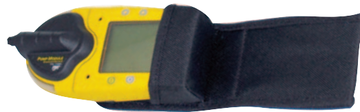
Carrying Holster GA-HM5 Fits securely on belt