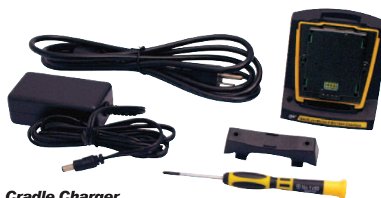
Cradle Charger M5-C01 Cradle charger for rechargeable battery packs