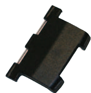
Replacement Battery Latch M5-BL-1