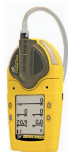
GasAlertMicro 5 PID Pump version with datalogging