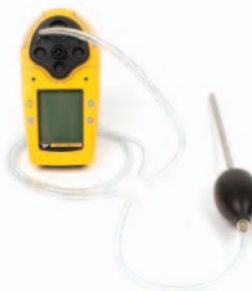
Manual Aspirator Pump GA-AS02 For remote sampling. Complete with probe, hose and aspirator pump