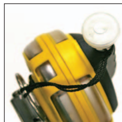
Auxiliary Pump Filter M5-AF-K2 / M5-AF-K2-100 Easily attaches with a quick connect fitting to provide additional pump protection