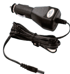
Vehicle Adaptor 12 Vdc GA-V-CHRG4 Vehicle adaptor cable for use with cradle charger (M5-C01)