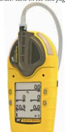
GasAlertMicro 5 Pump version