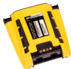
Rechargeable Battery Pack M5-BAT08/M5-BAT08B