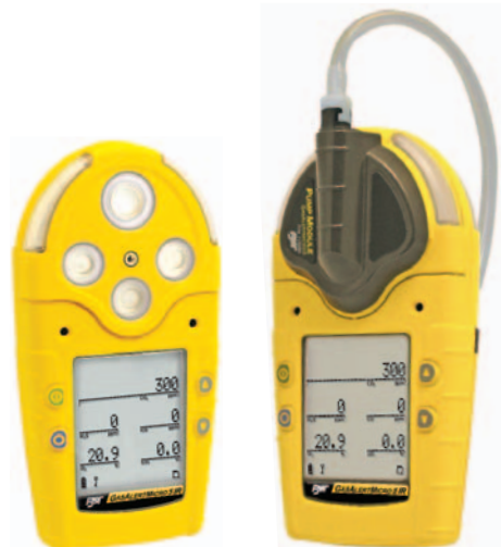
GasAlertMicro 5 IR Diffusion version with datalogging